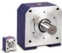
Standard Overhung Load Adaptors

For more information on custom or standard overhung load adaptors with SAE mounts, contact us or click here to find your local sales representative