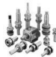
Custom Overhung Load Adaptors